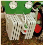
Front ballast with towing clevis