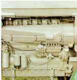
Fcl. 912 engine