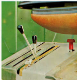
Auxiliary control units